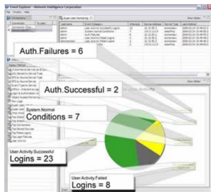
Event explorer screenshot

Event explorer: How do I manage all these alerts?